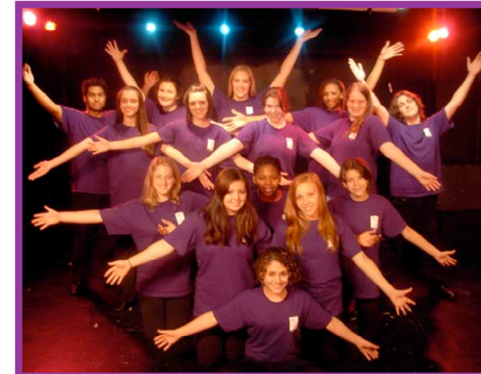
The 2008 Teens NYC Showcase Company of "Loud Whispers Silent Screams." This group made theatre history: nine of the twelve scenes performed were originals! Six of those were written by the teens themselves! Both the Kids and Teens NYC Showcase Companies once again enjoyed huge success with the agents and managers who attended.

Can't be IN the show? Make plans NOW to include it as a "must see" this December!